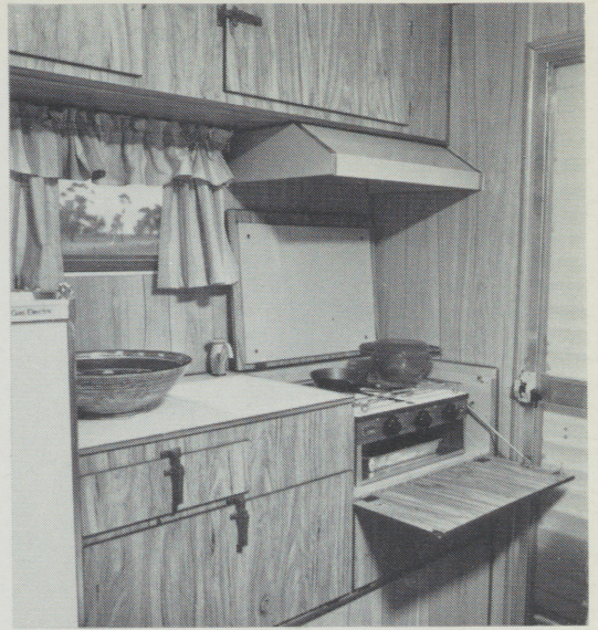
Your motel on wheels.