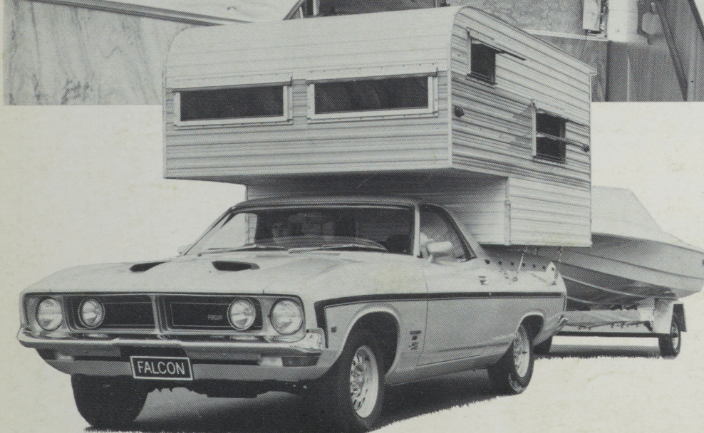
Vehicle illustrated with optional GS Rally Pack, and driving lights.

FALCON 500 UTILITY: Engine: 302 V8. Transmission: 3-speed all synchro column change. Manual standard. 3-speed auto column, 4-speed floor shift and T-bar cruisomatic optional. Tyres: 7.75 x 14 x 4. Power front disc brakes. Heavy duty battery. Driving lights.