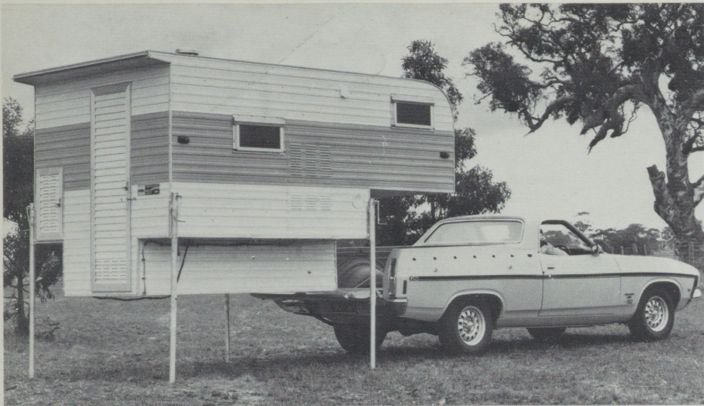
When your holiday's over—park your camper in the drive.