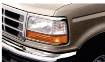
Light Saddle Clearcoat Metallic