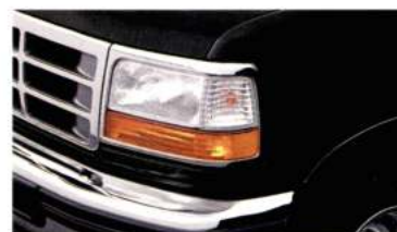
Raven Black (Black Clearcoat On SuperCab)