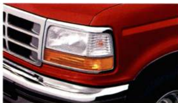
Bright Red (Clearcoat on SuperCab)