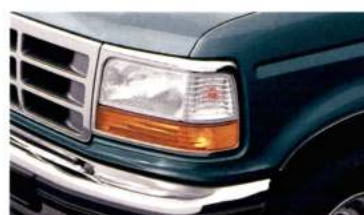
Reef Blue Metallic (Regular Cab)