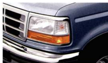
Portofino Blue Clearcoat Metallic