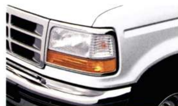
Oxford White (Clearcoat on SuperCab)