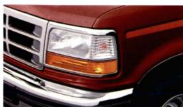
Toreador Red Clearcoat Metallic