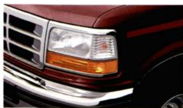
Dark Toreador Red Clearcoat Metallic