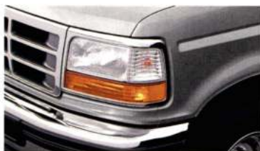
Silver Frost Clearcoat Metallic