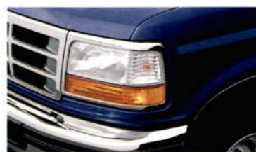
Moonlight Blue Clearcoat Metallic