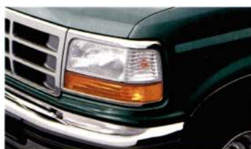
Pacific Green Clearcoat Metallic