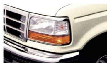
Colonial White (Clearcoat on SuperCab)