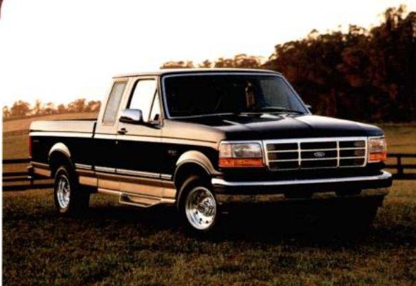
F-Series Eddie Bauer in ► Black Clearcoat over Light Saddle Clearcoat Metallic. Some equipment is optional.